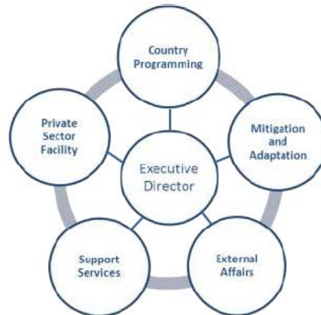
Figure 1: Initial Structure of the GCF Independent Secretariat